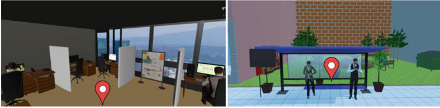
Fig. 2 Example taken from a previous paper that studied shoulder surfing in virtual reality [2]. The figure shows two virtual scenes that were used to investigate observing others' displays in an open office space (left) and a bus stop (right). The red markers indicate the participants' initial position

by the researchers. Here, the degree of presence can be assessed through the usage of presence questionnaires [50, 51, 59].