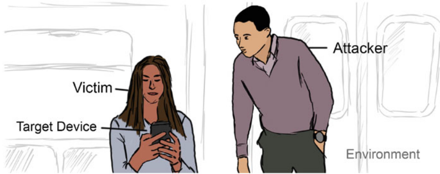
Fig. 1 Sketched example of a spontaneous shoulder surfing attack taking place during daily commute

Observation attacks are not limited to a specific device, location, or acquaintance level. Shoulder surfer can gaze at a person interacting with their personal phone or at someone's PIN, while they authenticate themselves after getting the phone out of the pocket. They do not need an extra device and can quickly memorize entered PINs or passwords. They could be standing in a train [46], or sitting next to the victim in an office [2] (see Fig. 1). The incident could occur between two closely tied people or with total strangers. Previous works confirm that observation attacks are widespread and highly likely to occur [14].