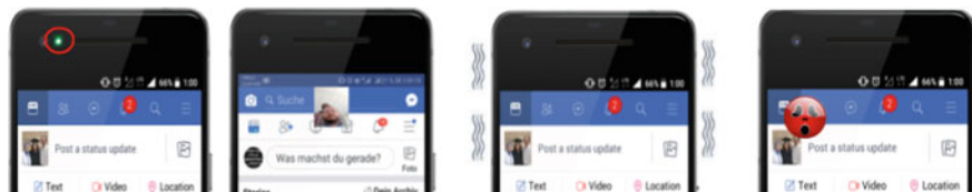
Fig. 5 Different feedback conditions to communicate a shoulder surfing incident investigated in previous work [44]. The different feedback conditions are (from left to right): (1) front LED, (2) video preview, (3) vibro-tactile, and (4) on-screen icon. The authors found that vibro-tactile feedback results in the lowest reaction time

Furthermore, different strategies have been proposed that do not rely upon detecting a shoulder surfer at first, but rather are applied constantly. For example, Chen et al. [12] developed Hide Screen, which utilizes human vision characteristics to preserve privacy. Simplified, the approach allows changing the readability of information based on the viewing angle. Instead of hiding the information from an attacker, Watanabe et al. [55] suggest adding additional information that is designed to throw an attacker off. They suggest showing multiple cursors on the screen