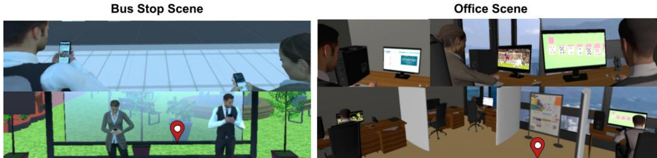
Figure 1: Study Settings: The open office setting (right) included three employees working at desktop computers. In the bus stop setting (left), two passengers interacted with their smartphones. The red markers depict participants' initial position.

wait for the bus. In the office space, we told them that they were waiting for a meeting and that somebody was to pick them up soon. Each scene lasted about two minutes. Once participants finished the tasks, they filled in a presence [40] and a post study questionnaire. At the end, we revealed the true purpose of the study. Each session lasted 30 minutes. Participants were compensated with 5 euros.